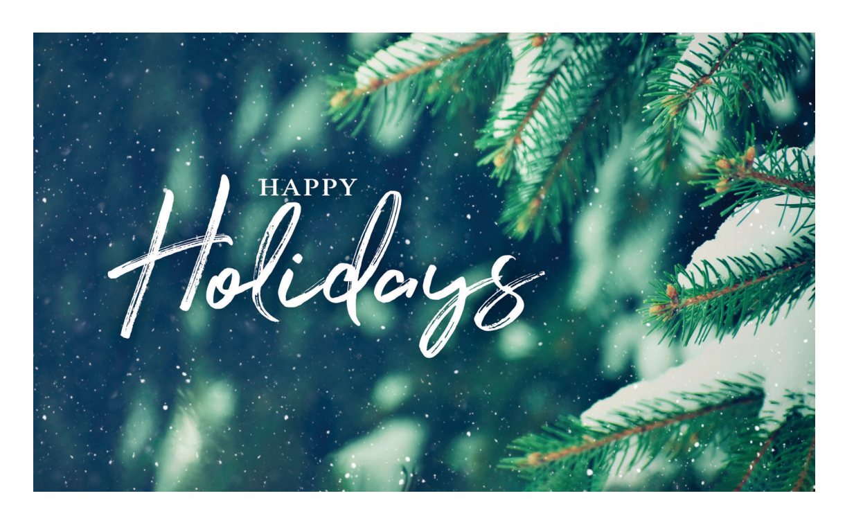
Included in this Month's Newsletter